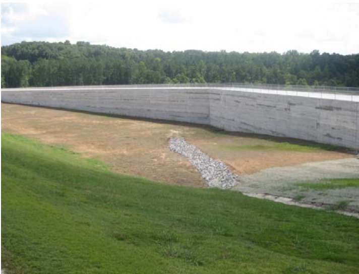
Figure 2: Recently Constructed Structure at Bear Creek Dam

Figure 2 shows the roller compacted concrete structure that was constructed at the downstream toe of Bear Creek Dam to block water passage under the dam that was completed in 2009. TVA is currently monitoring leakage at 17 dams. However, none of the dams being monitored for leakage require action to be taken at this time.