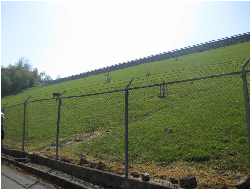
Figure 4: Monitoring Instrumentation at Blue Ridge Dam

A project is under way at Blue Ridge Dam to bring the dam up to the seismic requirements in addition to correcting a penstock bulge 9 that occurred during construction. To make the dam seismically stable, TVA is repairing and stabilizing the upstream and downstream faces of the dam, as well as stabilizing the tower on the upstream side of the dam that manages the intake water. This project began in July 2010. Figure 4 shows the monitoring in place at Blue Ridge Dam in preparation for upcoming work.