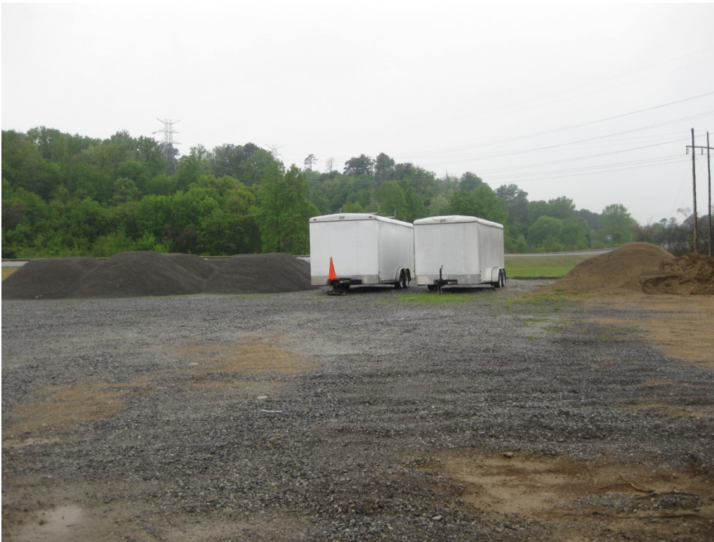
Figure 3: Interim Measures in Place at Fort Loudoun Dam

In 2003, TVA contracted with an external consultant to conduct a seismic hazard assessment. This study was completed in 2007 and included both probabilistic and deterministic analyses as required by FEMA 65 Earthquake Analyses and Design of Dams (FEMA 65). 8 Currently, TVA has contracted a consultant to gather information related to the population at risk and economies at risk. Based on this information, TVA will determine the MDE for each dam. Per FEMA 65, "Dams should be capable of withstanding the Maximum Design Earthquakes (MDE) without failure resulting in a catastrophic loss of the reservoir, or should